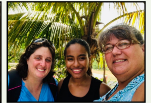
Minister one-on-one or to many