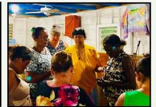
Alter call at a women's group