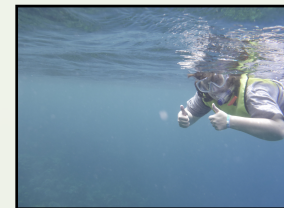
One free day to explore other adventures