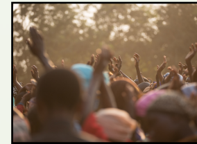
The people of the Islands are hungry for God to move