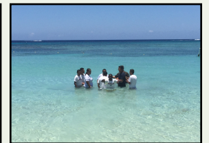
Baptisms in the Caribbean Sea